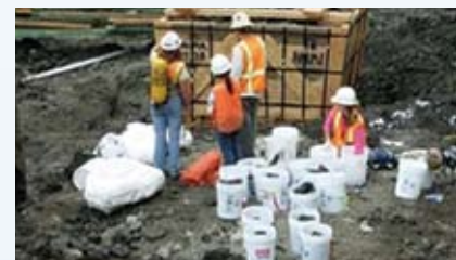
Mammoth Disruption: Construction screeched to a halt with the discovery of a nearly complete woolly mammoth skeleton and several other prehistoric fossils.