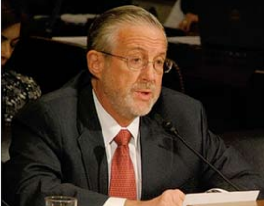
Commissioner Peter Lyons of the Nuclear Regulatory Commission.

As concerns about future energy needs for the world and the environment become increasingly important, the attention of energy producers has again turned to nuclear energy to play a larger part in the generation portfolio. The role the regulator plays in this initiative comes from the strategic goals of the Nuclear Regulation Committee (NRC):